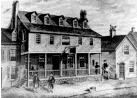
Tun Tavern 1775