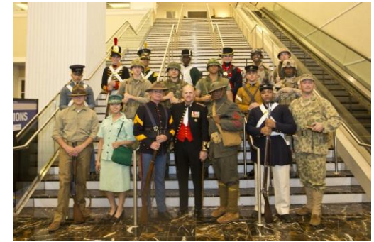
2016 Commandant's Marine Corps Birthday Ball

November 10 th at The Works in Loveland from 4pm to 8pm