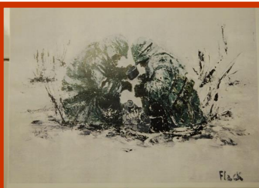
CUP OF JOE – Chosin Reservoir by John Flack (1927 – 2009 ) Cpl USMCR, WWII, No. China & Korea