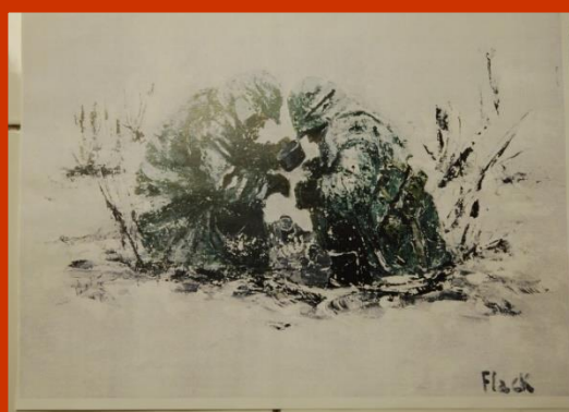
CUP OF JOE – Chosin Reservoir by John Flack (1927 – 2009 ) Cpl USMCR, WWII, No. China & Korea