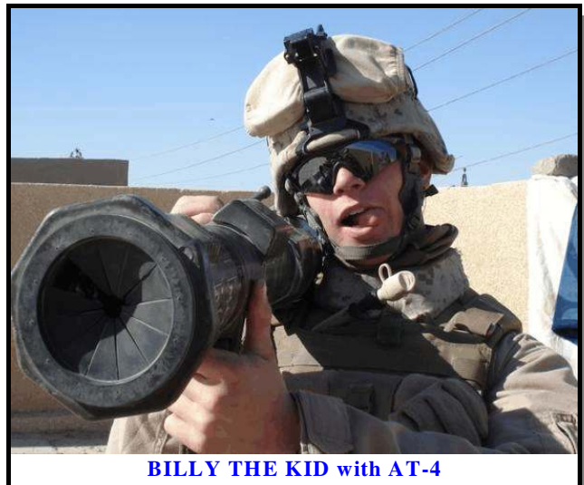
BILLY THE KID with AT-4