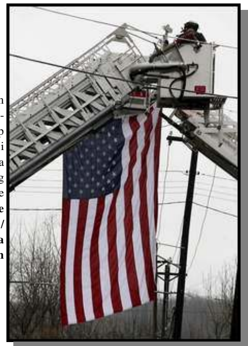
Firemen from Loveland-Symmes Twp and Miami Twp. raise a flag to hang above the street.