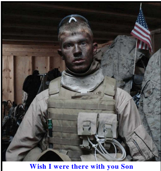
Wish I were there with you Son