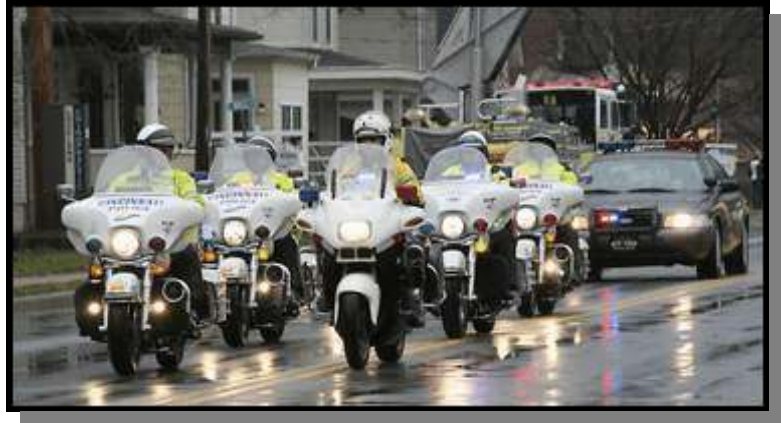
Cincinnati Police lead the military procession through the streets of Loveland.